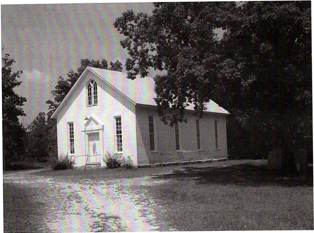
Mt. Olivet Presbyterian Church

(Church Cemeteries in the Eastern Section of the County)